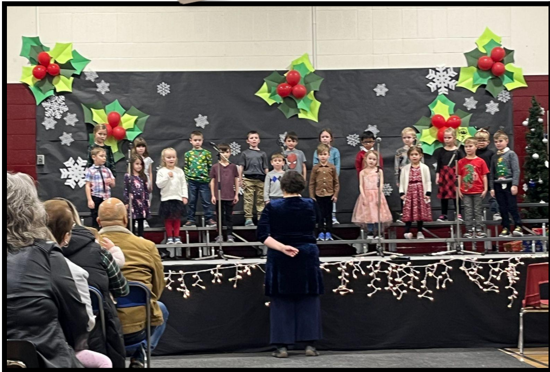
🎵 Kinder Concerts 🎵