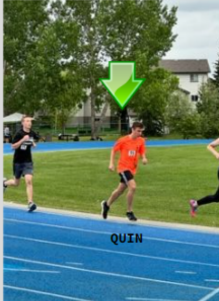
Quin - 3000m Beast!