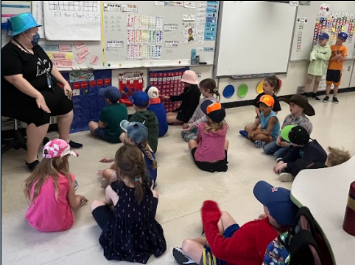
Hats on for Mental Health