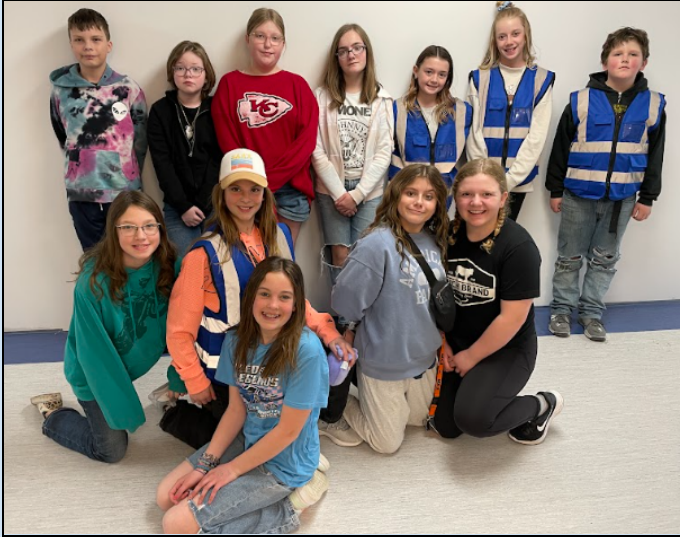
Blueberry Recess Buddies