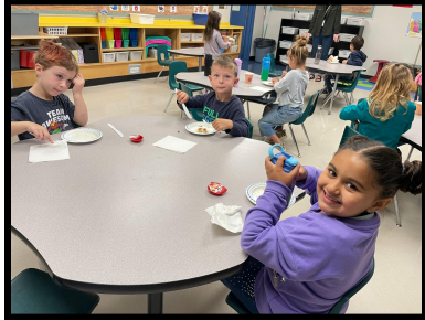
Pancake Breakfast September 8, 2023