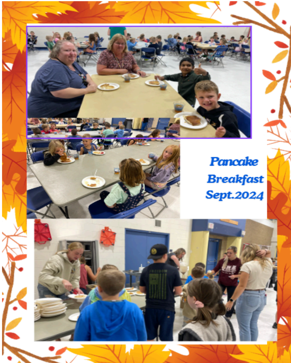
Pancake Breakfast Sept. 2024