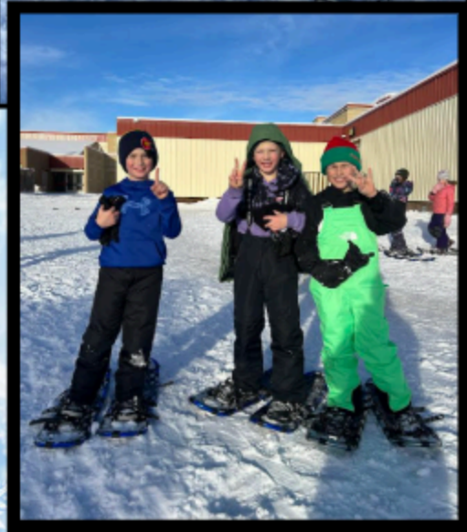
Grade 3 SNOWSHOEING